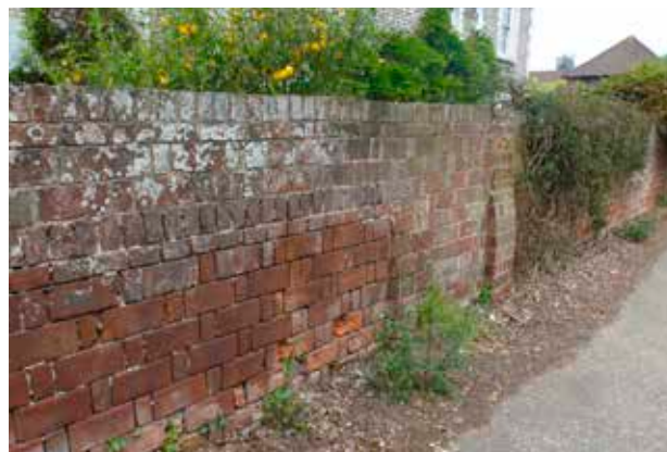
Rat-trap bond brick wall at Dhobi and Random Cottages

Boundaries of note, as identified on the townscape appraisal map include: