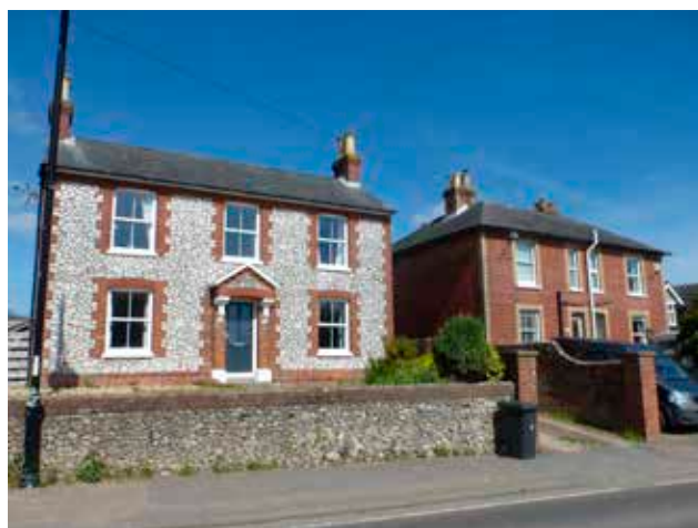
Nos 76-90 (even) Fishbourne Road West