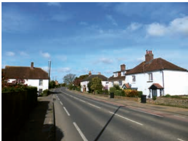
Old Fishbourne, looking north along Main Road