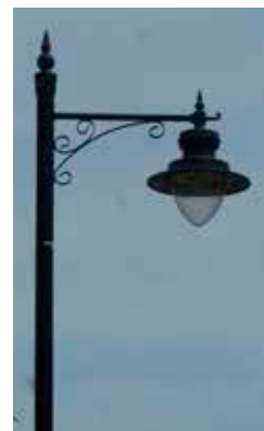
Heritage style lamp post

Joining the footpath from the mill pond at the end of Mill Lane, there are some characterful historic metal kissing gates and sections of fencing.