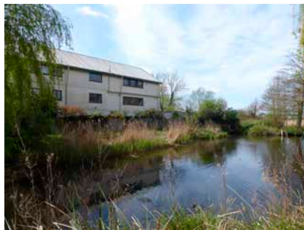
Salt Mill House and Fishbourne Mill looking over the former tidal millponds