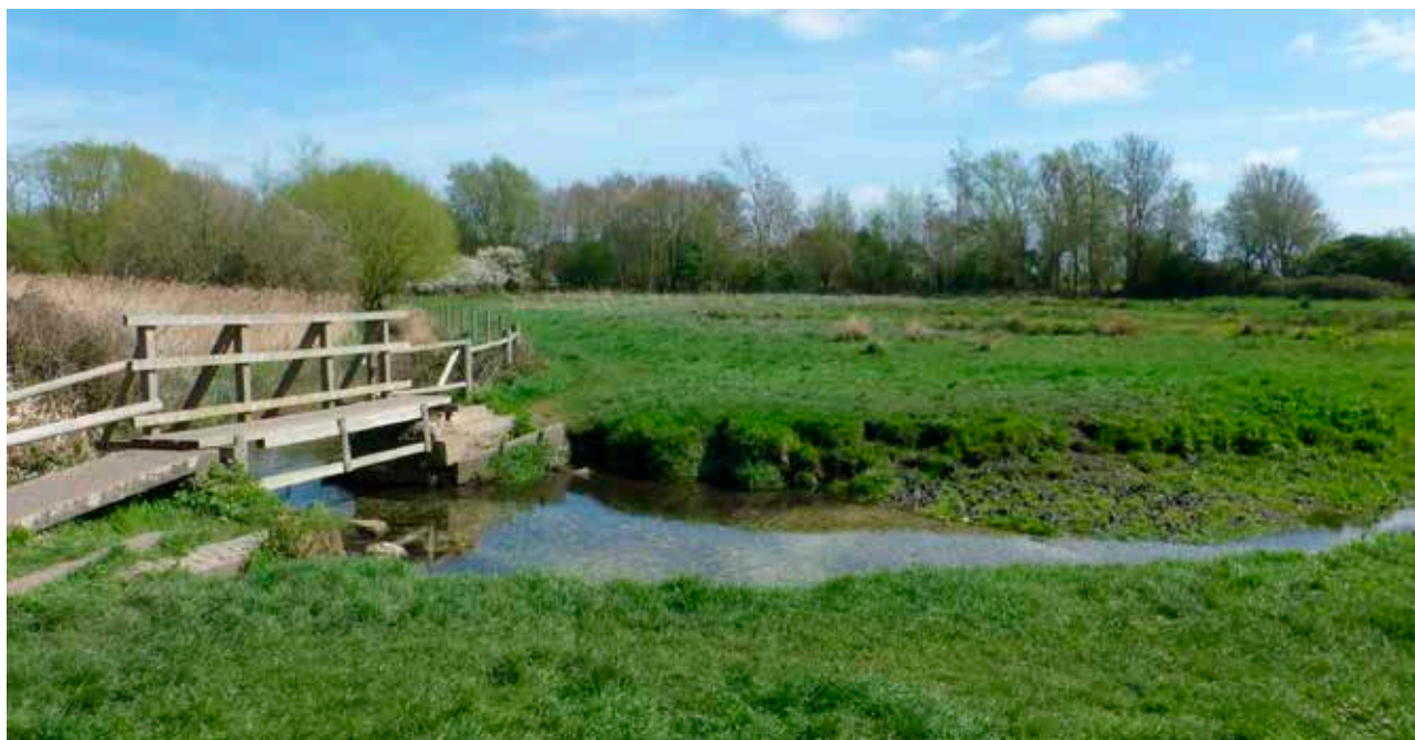
Fishbourne Meadows looking south-east from footpath

The majority of the Fishbourne Conservation Area, south of the A259, lies within the Chichester Harbour Area of Outstanding Natural Beauty, designated in 1964 for its unique blend of landscape and seascape. Chichester Harbour is also designated as an SPA/SAC (Special Protection Area for Wild Birds/Special Area for Conservation) and a Ramsar site (i.e. a wetland of international importance under the 1971 Ramsar Convention).