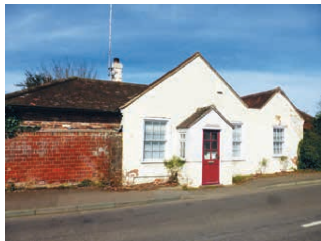
Former 19th century Dame School, now Old Fishbourne Cottage in Salthill Road

Chichester Water Works was established in c.1874 to bring clean drinking water to local residents. A site north of the main road in Salthill Road was first considered, but it was built next to the springs that supplied the mill pond for Fishbourne Mill. Unfortunately, this meant that there