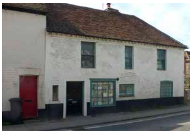
No 87 Fishbourne Road West (The Old Sweet Shop)

Mill Lane connects the main road to the Fishbourne Channel and is the historic location of the various mills that once formed an important part of the local economy. Mill Lane is on a slight incline with the majority of the village located just above the five metre contour and therefore above the usual floodplain. Historic maps confirm that in the mid-19th century there was no other development along the lane.