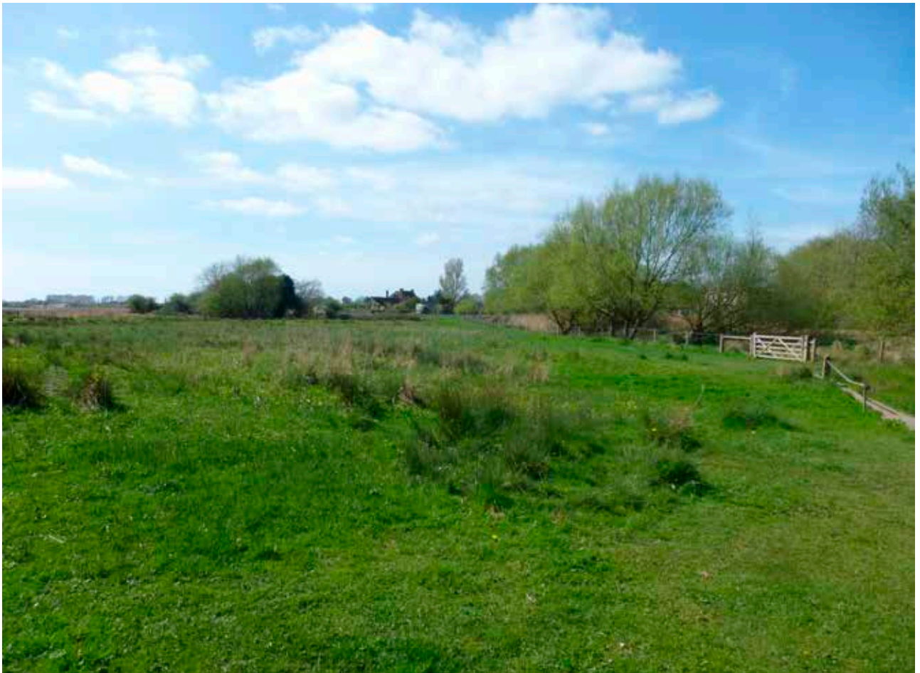
Fishbourne Meadows may have been the site of the Roman Harbour