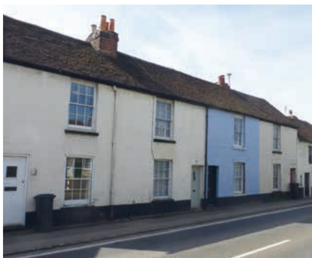
Nos 79-85 (odd) Fishbourne Road West

It's now converted former outbuildings in Farm Close further enhance this. The nearby terrace forming April Cottage, Little Dolphins and Mermaid Cottage represents the other half of this important development, small early-19th century cottages which were interspersed with the farms. The Black Boy Inn is 18th century, but its setting has been substantially impacted by modern additions to the building. Further west, North Villa is a fine 18th century farmhouse.