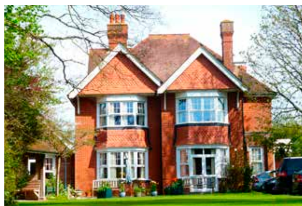
Cornelius House, Fishbourne Road West