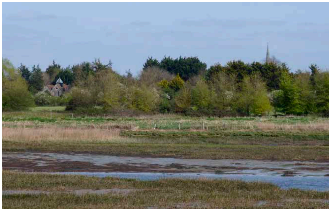
Looking east to church over Fishbourne Channel, with spire of Chichester Cathedral in the background

The Fishbourne Conservation Area is almost entirely in residential use apart from the three public houses – The Bull’s Head, the Woolpack Inn and the Black Boy Inn; the water works which has been in existence since the 19th