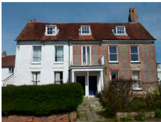
Nos 102 and 104 Fishbourne Road West