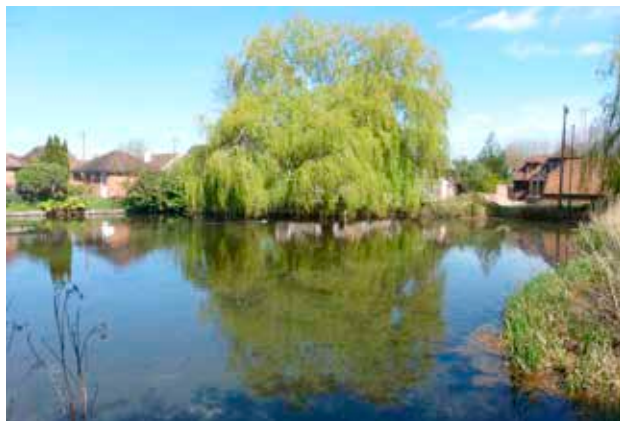
Mill pond and large Willow tree