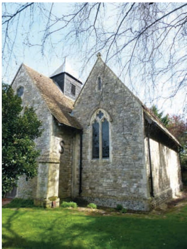
St Peter and St Mary's Church