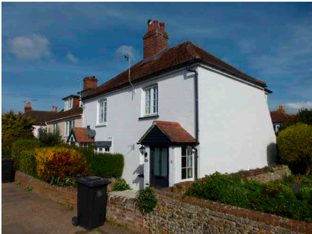
Appletree Cottage + Smiths Cottages