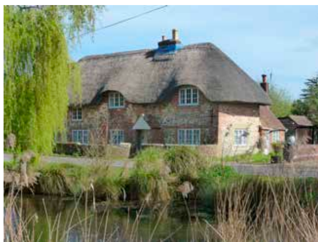
The Old Thatched House, Mill Lane