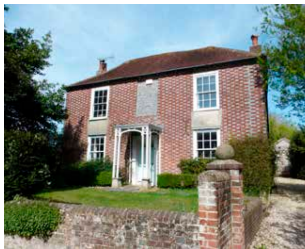
No 56 Fishbourne Road West

The majority of listed buildings are 18th or early 19th century in date, mostly two storeys and facing Fishbourne Road. The most significant in townscape terms is the Bull's Head Public House, an imposing brick structure with a somewhat altered front porch and a steeply pitched roof above a brick dentil eaves cornice. This detail is typical of the period and therefore can be found on many other buildings in the Conservation Area. The rear extensions to this building which abut Mill Lane and are faced in brick and flint contribute to views along the road. A single storey brick and flint outbuilding, presumably a former stable is another important feature of this group.