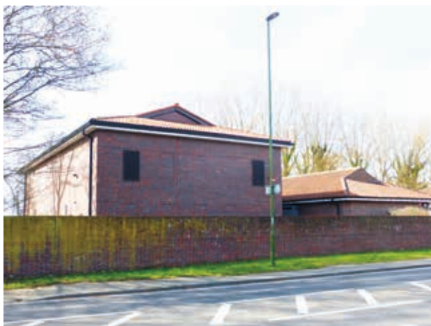
Portsmouth Water Company, modern buildings on the site of the 19th century Chichester Water Works

Many of the positive buildings are shown on the 1839 Tithe Award map and despite some modern alterations, may be eligible for statutory listing. Notable among them are The Globe House, Rose Cottage, Roman Landing, The Old Bakehouse, and Dhobi and Random Cottages.