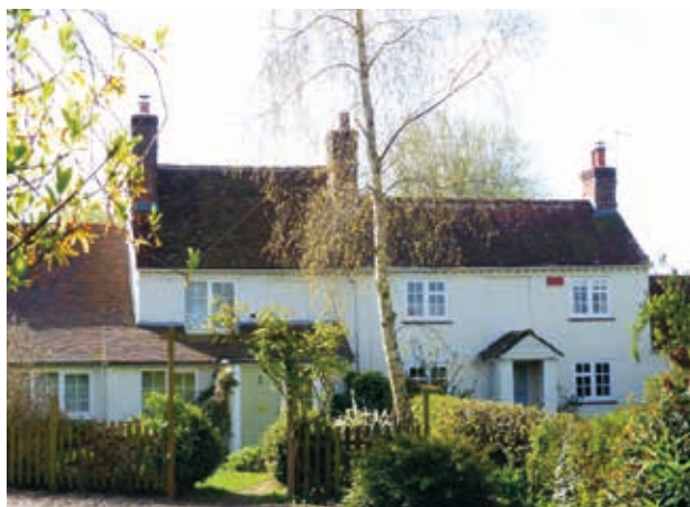
Nos 4-6 Old Park Lane