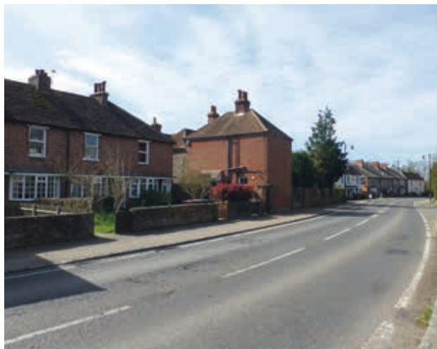
View W - Fishbourne Rd W

The special interest in Fishbourne lies in the surviving physical evidence of its continuous development since the Roman period. Its primarily agrarian economy owed its success to the rich soils of the coastal plain and its proximity to a harbour that enabled trade and the development of minor industry.