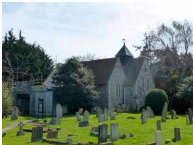
St Peter and St Mary's churchyard

The Character Appraisal concludes that the key characteristics of the Conservation Area are: