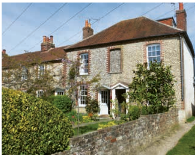
Nos 79-85 (odd) Fishbourne Road West

Aside from the Church, the oldest listed buildings are believed to be in Mill Lane – Saltmill House and The Old Thatched House (formerly Pendrills Cottage). Saltmill