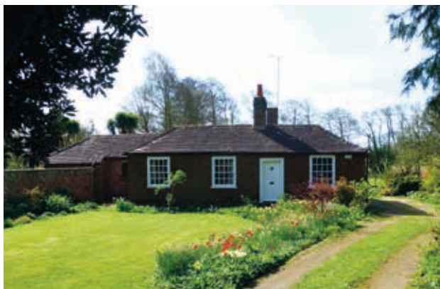
No 113 Fishbourne Road West

Positive buildings are marked on the townscape appraisal map and should be considered in conjunction with section 4.7. The loss of buildings identified as positive should be strongly resisted. Where they exist, opportunities to enhance or better reveal the significance of the Conservation Area through works to positive buildings should be sought.