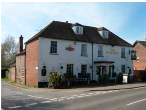
The Bulls Head

There was a considerable amount of building in both Old and New Fishbourne with houses and cottages put up facing the new road. Some of the smaller cottages were built on waste land, many still in existence today.