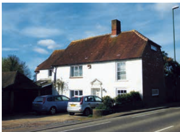
The Globe House, a former inn

Mill Lane is much quieter and retains the character of a rural backwater. There are fewer historic buildings, but the lane ends dramatically in a pretty cottage now known as The Old Thatched House (formerly Pendrills Cottage), the mill, mill pond and in the distance, Saltmill House. The close proximity of the Fishbourne Channel is evident from the many sea birds and views over the adjoining reed beds, although it is necessary to go beyond the boundary of the Conservation Area to obtain views of the estuary.