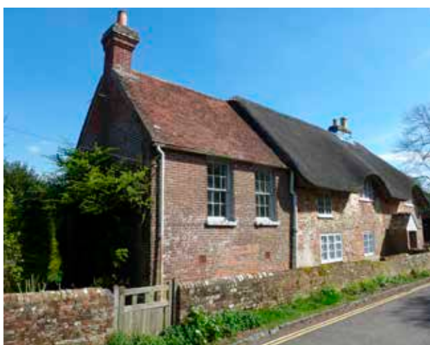
The Old Thatched House, Mill Lane

Walkers and other visitors are attracted to the area due to its location at the head of the Fishbourne Channel and the many public footpaths across the reed beds as well as those over the adjoining Fishbourne Meadows. These areas provide a pleasant contrast with the noise and traffic along Fishbourne Road and the nearby A27.