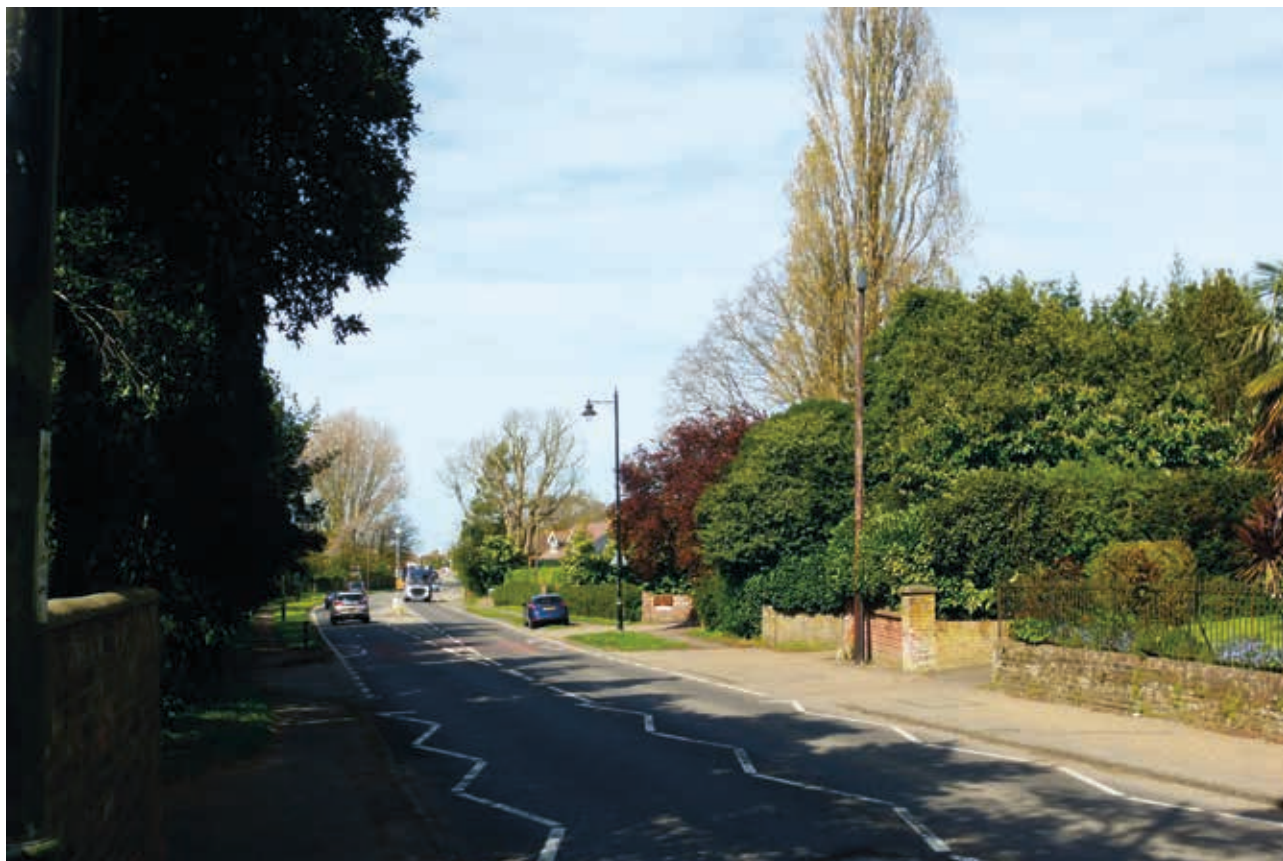
Main Road, Fishbourne