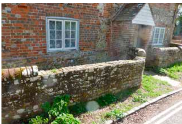
The Old Thatched House, Mill Lane – flint and brick boundary wall with saddleback brick copings missing