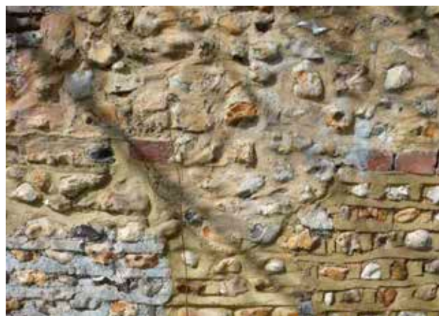
The Bulls Head - poor flint repair