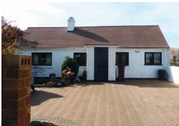
The Old Forge, Main Road

Smallholders turned to grazing or dairy farming or to nurseries and market gardening, the produce being sold in Chichester's Butter Market. Besides Salthill Park, there were few other larger farms in both New and Old Fishbourne. Both villages had blacksmiths and wheelwrights; in New Fishbourne there was one forge by the Blackboy and another, now Forge Cottage, near the Globe. Each village also had a baker, a grocer, a butcher, carpenters and shoemakers who plied their trade from their cottages. An early 19th century Dame School also existed on Salthill Road (No. 5), now Old Fishbourne Cottage.