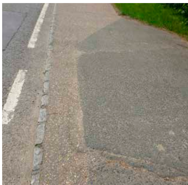
Poor repairs to pavements with different tarmac

There are hardly any historic paving materials in the Conservation Area, the pavements of which are generally covered in black tarmac with modern concrete kerbs. Some setted gutters remain, such as the single row of granite setts in Mill Lane next to the Bull’s Head Public House, and further southwards, the edge of the grass verge is defined by short lengths of stone. A similar detail can also be seen along sections of Fishbourne Road. The simplicity of these materials suits the rural Conservation Area, which is enhanced by the wide grass verges in a section of Fishbourne Road. Simple traditional street name signs are made from aluminium, with black lettering on a white background.