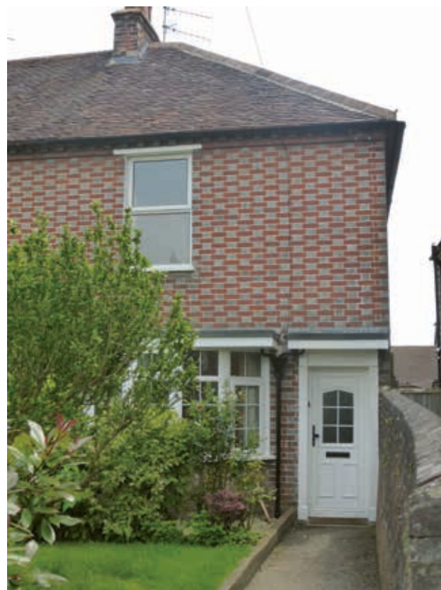
UPVC window and door