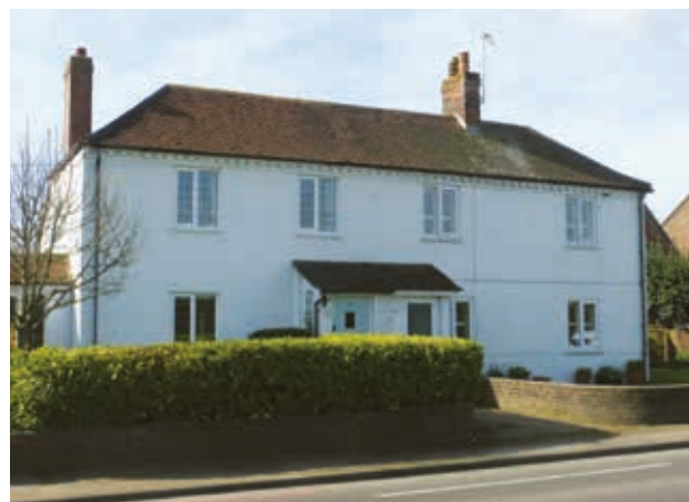
Nos 1 and 2 Forge Cottages, Main Road

No. 56 (The Bays) Fishbourne Road is very good example of the use of red brick with grey headers to create a chequer pattern. Nos. 89-95 (odd) Fishbourne Road have similar elevations of red and grey brick, below a steeply pitched tiled roof. The Globe House and Bull's Head Public House would appear to have been built from these materials, and these presumably remain below their painted elevations. North Villa has a fine red brick elevation while Nos. 102 and 104 Fishbourne Road are both faced in continuous grey header bricks with red brick dressings, but sadly no. 104 has been painted. Otherwise there is a good deal more painted brickwork on both unlisted and listed historic buildings in the Conservation Area, usually white or cream.