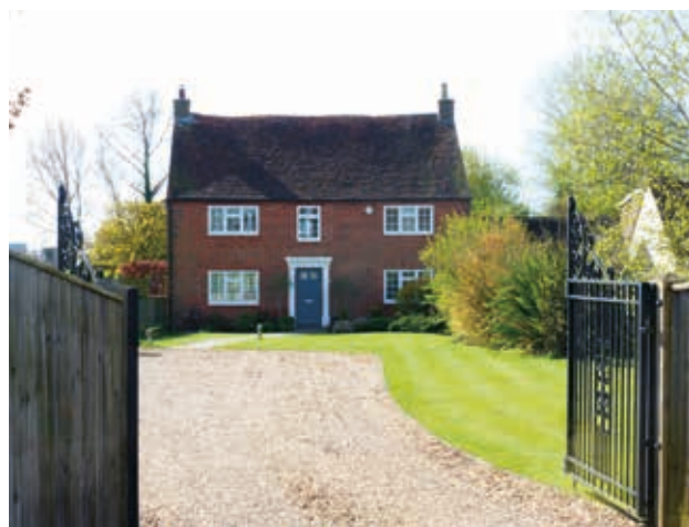
Lowood House, 2 Old Park Lane (the roof of No 3 is visible on the right)