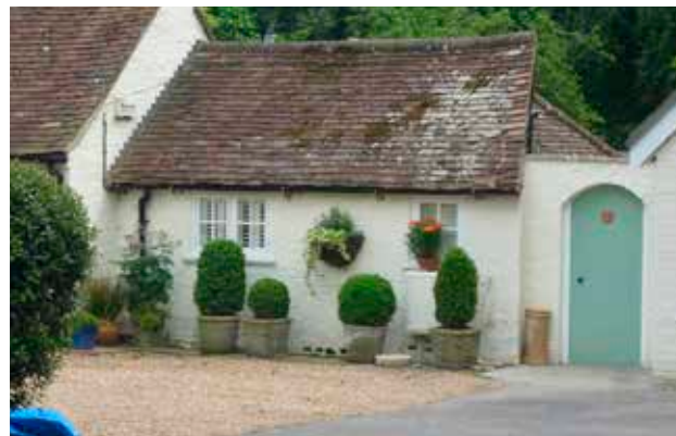
No 57 Fishbourne Road West