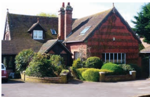
The Old School House