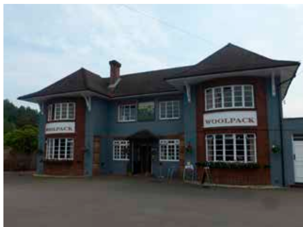
The Woolpack Public House

listed as a tavern called the Bull's Head. Another, known as Malshes, added a large Malthouse and tannery. The malthouse continued until the 19th century but was later demolished. A pair of cottages, coalyard, cartshed and stable was built on the site of the farmhouse. In 1728, a cottage was built east of Malshes which became a beerhouse called the Woolpack, later replaced in 1936 by the present Woolpack. Next to the Woolpack was a dairy farm, now called Roman Landing. Further east, the land was divided into strips on which several small cottages were built; early in the 19th century these were enlarged into houses. The Coverts was built in 1798 at the west end of the village.