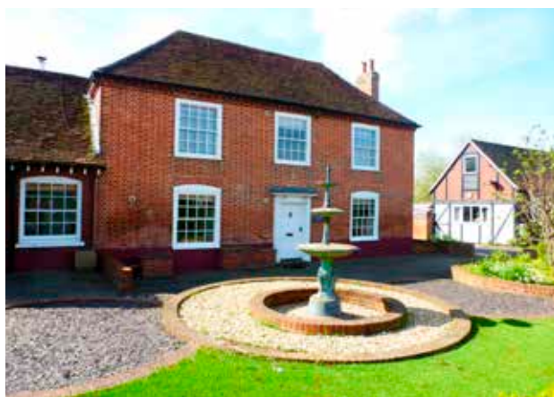
The Black Boy Public House

In the 19th century, Fishbourne was still essentially a farming community. To the north of Old Fishbourne Salthill Park, around Salthill House, was the dominant estate. While fortunes had increased during the Napoleonic wars from an increased demand for grain, after the war ended there was a recession and competition for grain from abroad. Few new buildings were put up in the 19th century, with the exception of Salthill House (early 19th century) and Florence Villa (1870). In Old Fishbourne, Old Park and Gothic Cottage (listed buildings south of the Conservation Area) were both enlarged in the late Georgian period into handsome regency houses. A few small houses were added to those on the north side of the main road, while the Malthouse opposite the Blackboy was converted into three cottages and the Blackboy itself was considerably enlarged.