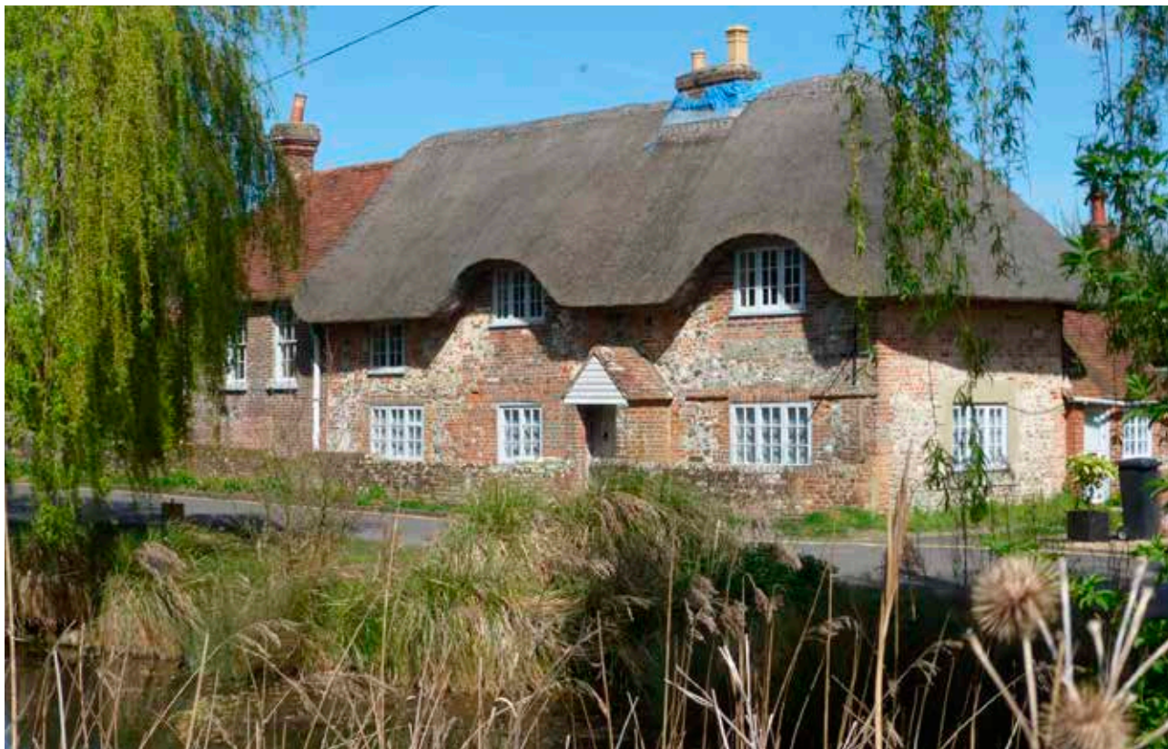
The Old Thatched House in Mill Lane was historically the miller's cottage