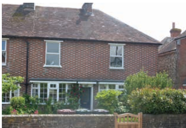
Unsympathetic windows in historic terrace.

Recommendation: The District Council will encourage owners and building professionals to follow Historic England’s guidelines for best practice in Repointing Brick and Stone Walls.