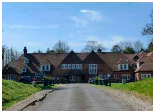
Manor Barn, Appledram Lane