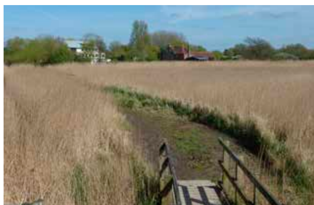
Mud flats of Fishbourne Channel, looking north towards the Conservation Area over reeds

The Landscape Character Assessment also includes a number of recommendations for the improvement and conservation of the whole Character Area covered in its Planning and Land Management Guidelines.