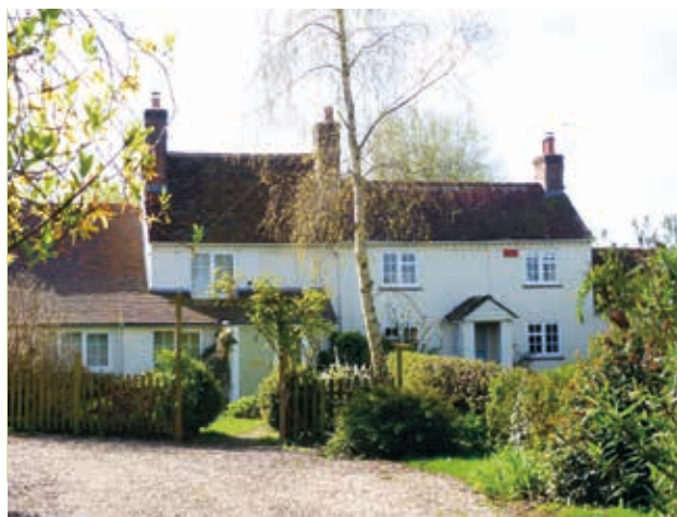
Nos 4-6 Old Park Lane