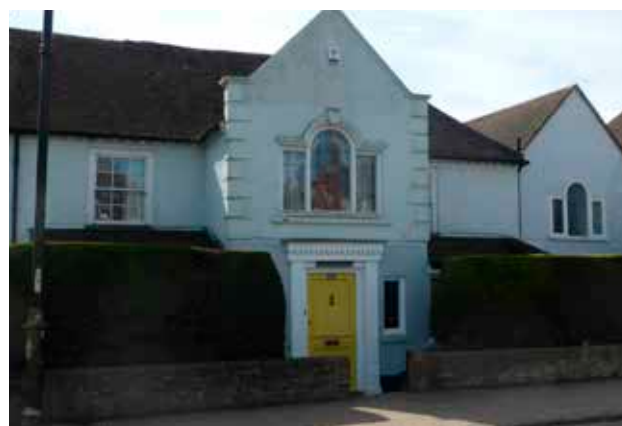
Roman Landing, 69 Fishbourne Road West