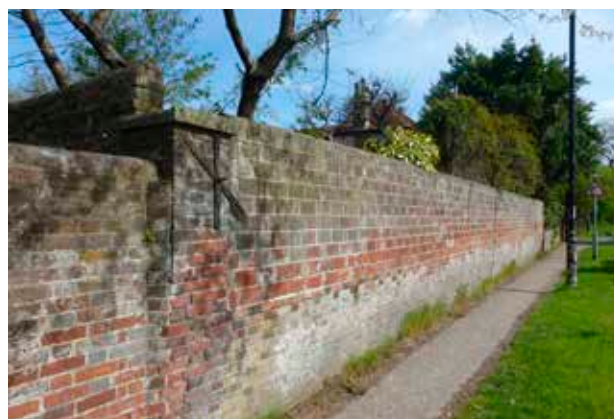
No 56 Fishbourne Rd West