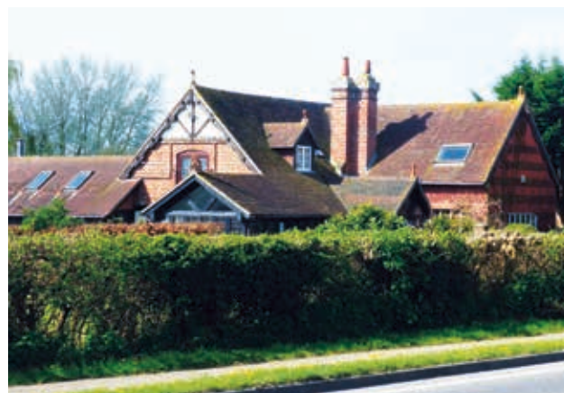
The Old School House, Main Road

At the end of the Victorian period, both villages were typical of the period and Fishbourne retained the atmosphere of a quiet village until after the First World War. New building in the early 20th century was steady in the village; in 1905 a new church hall was built in Mill Lane, behind the Bull's Head, then owned by the Chichester Brewery of Henty & Sons. The early twentieth-century New House still exists but its garden has been developed along Fishbourne Road West. After 1933 the rate of building increased, especially at the east end of the village, in New Fishbourne. Between the 1930s and 1960s the Creek End estate was established and some properties built on the east side of Mill Lane north of The Old Thatched House. There was also large swathes of development to the north, along the railway line, which has continued to this day.