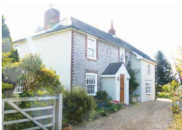
Home Farm, Main road with its distinctive flint elevation