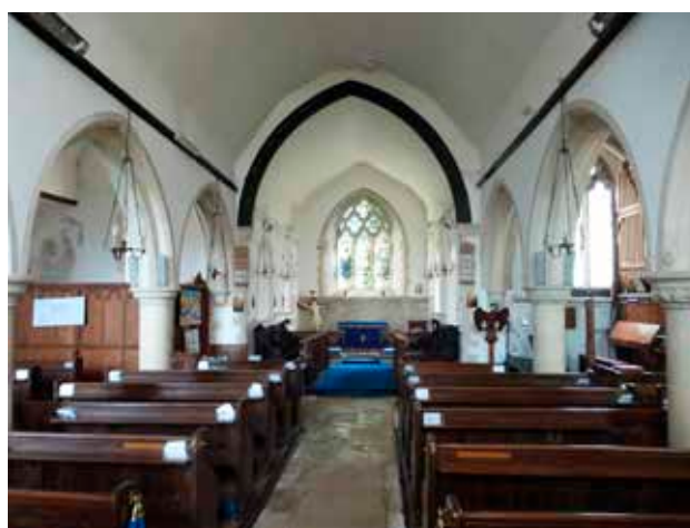
Nave of St Peter and St Mary's Church

with a bell cote above. The chancel probably represented the nave of the medieval building. In 1821 the architect George Draper undertook a major rebuilding including the addition of a transept, a porch and the vestry, and in 1847 this transept was extended westwards to form a north aisle and the nave was lengthened westwards. The chancel still contains one 13th century lancet window. A cruciform building is shown on the 1839 Tithe Award map, and nearby, "Church Farm" – the Manor House and associated farm buildings. The group is separated from New Fishbourne by the broad swath of land which constitutes Fishbourne Meadows. The church is connected to the village by a footpath which still remains, and which stretches across Fishbourne Meadows to the east end of Fishbourne Road. The Old Rectory, a timber-framed building, sits on the opposite side of the A27, isolated from the Church group and amongst later suburban development of Chichester.