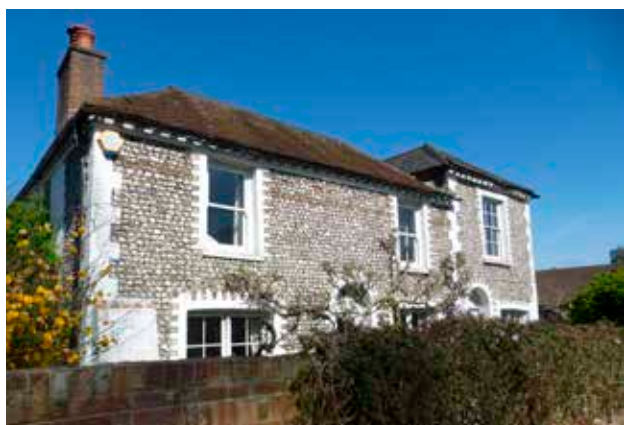
Dhobi and Random Cottages, 1 and 3 Salthill Road