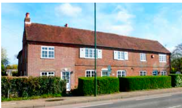
Early 19th century terraced cottages in Old Fishbourne, Little Dolphins, April and Mermaid Cottages

The key features of the Conservation Area which inform its character are: