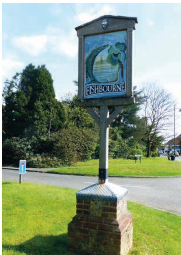
Fishbourne village sign

Under Article 4 of the General Permitted Development Order, the Authority may impose directions to further withdraw permitted development rights. However, this is only justified "where there is firm evidence to suggest that permitted development which could damage the character or appearance of a conservation area is taking place or is likely to take place, and which should therefore be brought into full planning control in the public interest" .