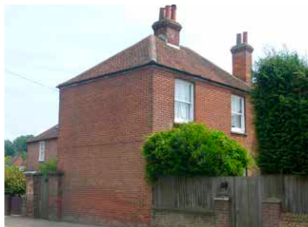
Calloways, Fishbourne Road West