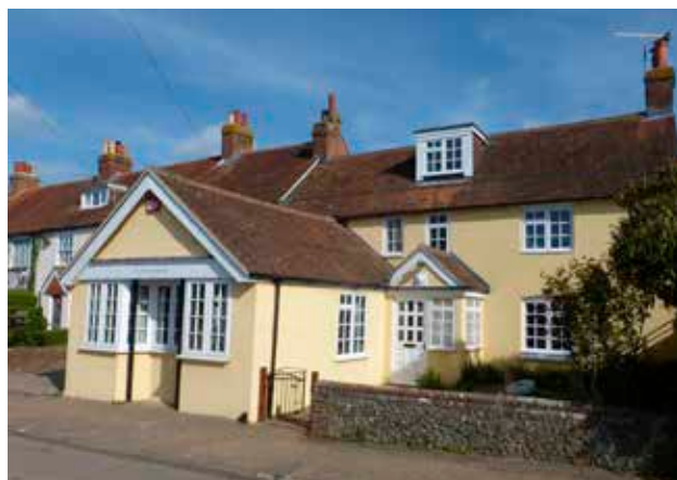
The Old Bakehouse, formerly Blakes Bakery, Main Road

The rebuilding of St Peter and St Mary's Church by George Draper in 1821 and again in 1847, no doubt sought to cope with the growing congregation. There was also a small Primitive Methodist Chapel on the south side of Fishbourne Road West in 1840, but this has recently been replaced by Nos 77 and 77A. The primary school, in Old Fishbourne, opened in 1876 and from then all children from both New and Old Fishbourne had to attend the Fishbourne School until they were 13, free of charge. The school was relocated in 1973 to its present site in Roman Way.