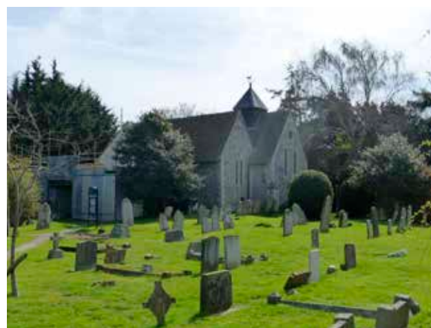
St Peter and St Mary’s church