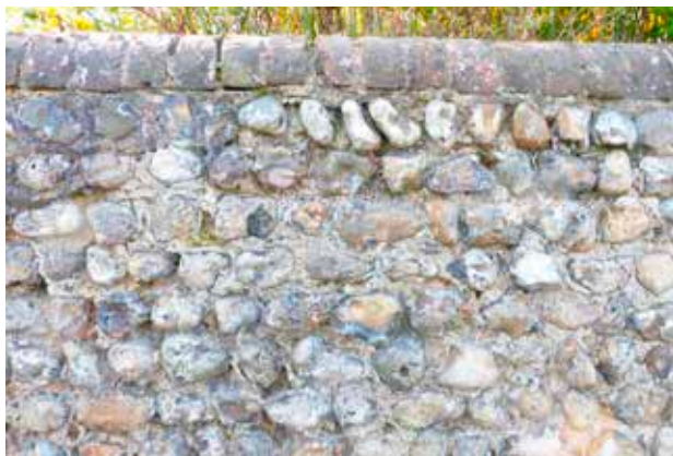
Flint boundary wall at Home Farm

Part of the two metre high wall to Fishbourne Palace is made from red brick laid in rat-trap bond, a typical Sussex detail. In Mill Lane, clipped beech hedging defines several gardens including the former side garden to The Old Thatched House (formerly Pendrills Cottage). A low flint wall with brick coping which encompasses the garden to Salt Mill Cottage is important in views across Fishbourne Meadows. Low brick and flint walls are also visible along Fishbourne Road and therefore contribute to its character, especially as viewed from the main road. The metal fencing along Fishbourne Road West and at the end of Mill Lane at the junction with the footpath following the river to the east are characterful.