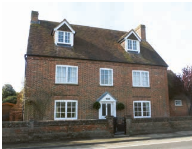
North Villa, Main Road