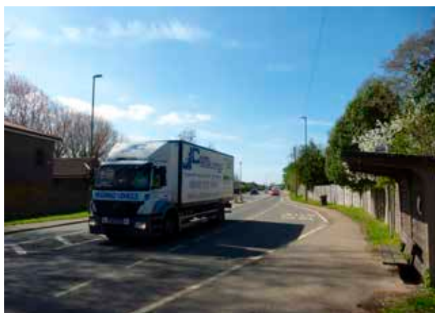
Traffic on Fishbourne Road West