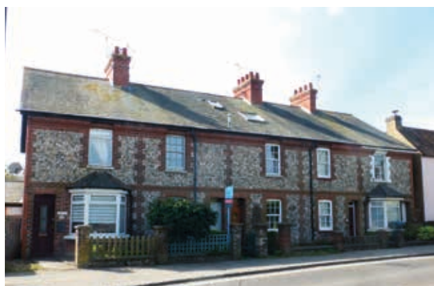
Nos 101-109 (odd) Fishbourne Road West

Article 4 Directions are made under the General Permitted Development Order 1995 (as recently amended), and can be served by a local planning authority to remove permitted development rights where there is a real threat to a particular residential building or area due to unsuitable alterations or additions. An Article 4 Direction is accompanied by a Schedule that specifies the various changes to family dwellings, which will now require planning permission. Usually, such Directions are used in conservation areas to protect unlisted houses in use as a family unit, rather than flats or bedsits where permitted development rights are limited.