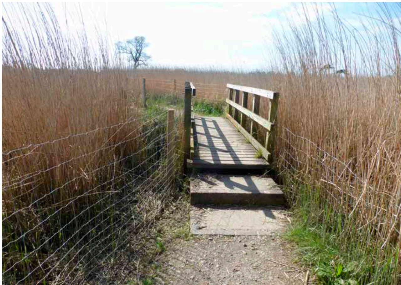
Footpath looking south over Fishbourne Channel