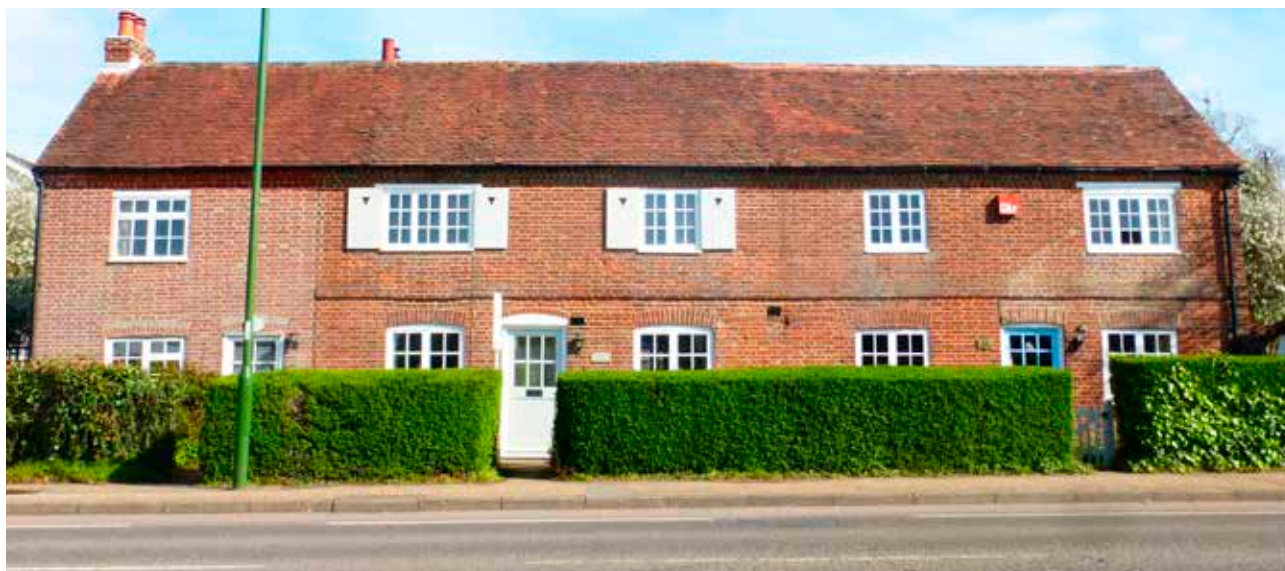
Little Dolphins, April and Mermaid Cottages

The original 13th century St Peter and St Mary's Church may have consisted of the present Chancel only; the nave and the bell-cote were probably added in the 14th century. It was built of flint rubble with stone dressings and roofed in tile. The chancel, nave and wooden bell-cote remained little changed until 1821 when the transept was added to the north and a porch attached. After the addition of the south aisle in 1847, the north transept and nave were extended westwards and the north porch was reconstructed. In 1973 the porch was replaced by a new choir vestry.