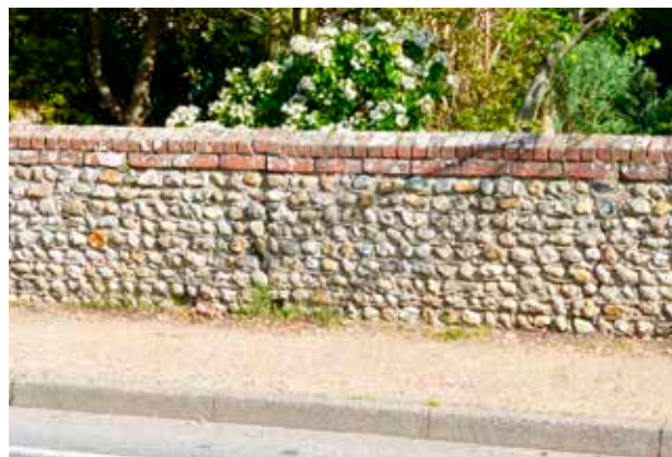
Boundary wall on the north side of Main Road, outside Fortune House