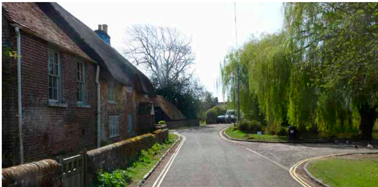
View South on Mill Lane