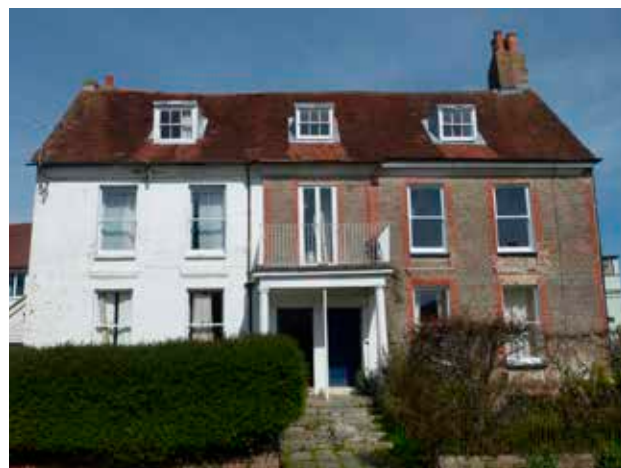
Nos 102 and 104 Fishbourne Road West

Invariably, flint walls are defined by brick quoins to the window and door openings, and the corners of the buildings. Bricks are also used for distinctive dentiled eaves on many of the older buildings, even where they are rendered. The Old Thatched House (formerly Pendrills) is a pleasing mix of flint with a wide variety of red bricks of varying sizes and ages. An occasional larger stone, in dark grey, adds variety and was probably brought up from Bosham where there are many more examples of this type of (imported) stone. At the back of the Bull's Head Public House, roughly knapped flints laid in approximately horizontal courses, provide a pleasingly rustic wall finish. No. 87 (The Bend) Fishbourne Road is an unusual example of an 18th century painted flint and rubble house, with a small late-19th century shopfront. Another flint-faced terrace, nos. 101-109 dates